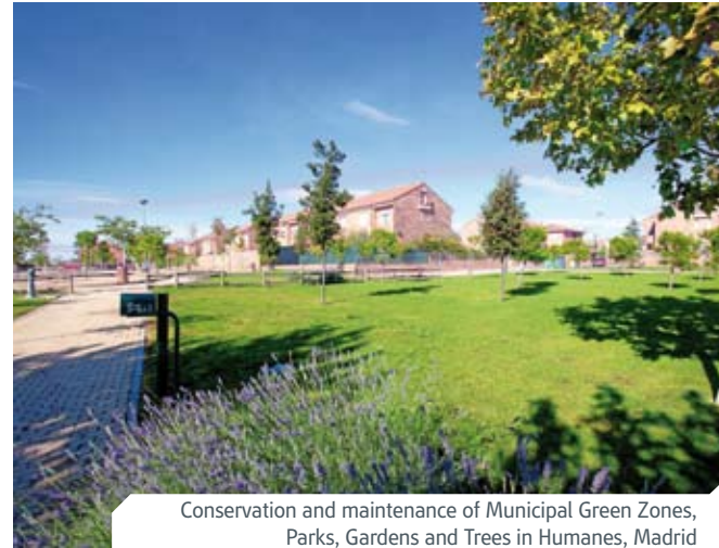
Conservation and maintenance of Municipal Green Zones, Parks, Gardens and Trees in Humanes, Madrid