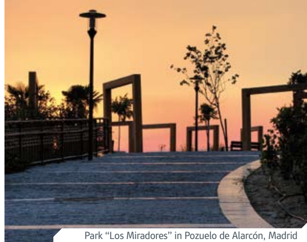
Park “Los Miradores” in Pozuelo de Alarcón, Madrid