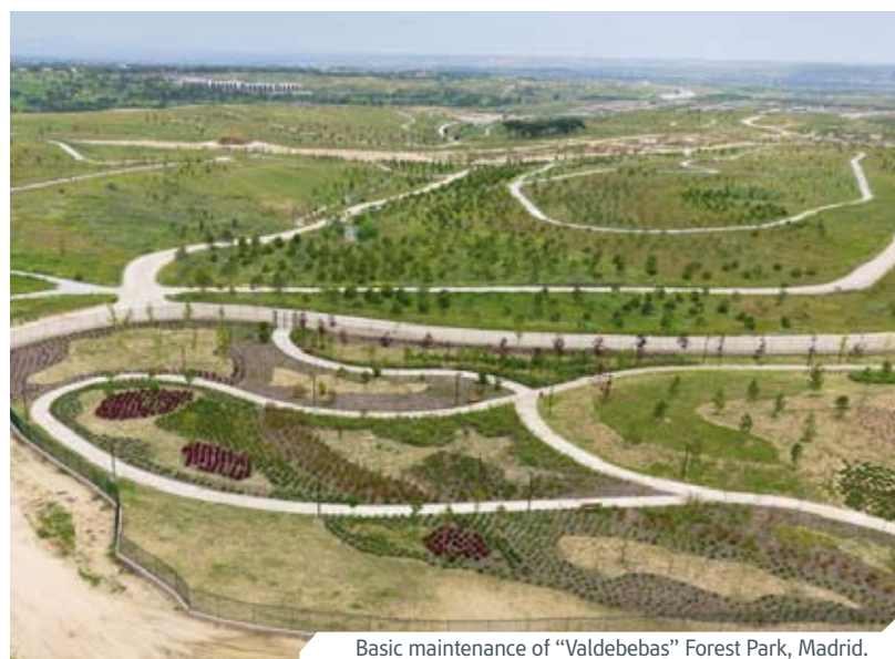
Basic maintenance of “Valdebebas” Forest Park, Madrid.