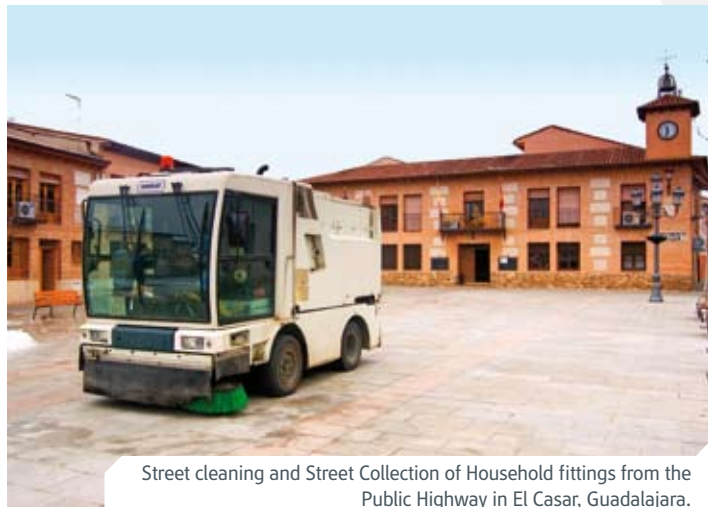
Street cleaning and Street Collection of Household fittings from the Public Highway in El Casar, Guadalajara.