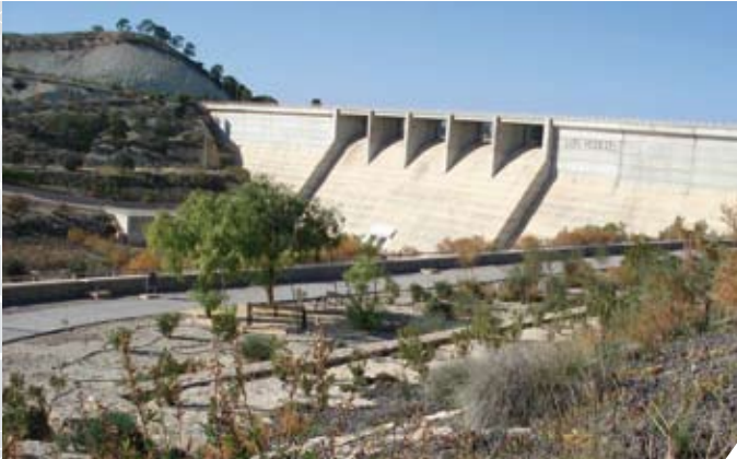
Services for maintenance and conservation of the “El Bayco”, “El Boquerón”, “Los Charcos”, “José Bautista”, “Moratalla,” “Moratalla”, “La Risca” and “Los Rodeos” Dams, miscellaneous municipal areas (Albacete and Murcia).

Environmental restoration of our rivers, along with proper hydraulic operation, while ensuring protection against floods, making the recovery of currently endangered ecosystems possible