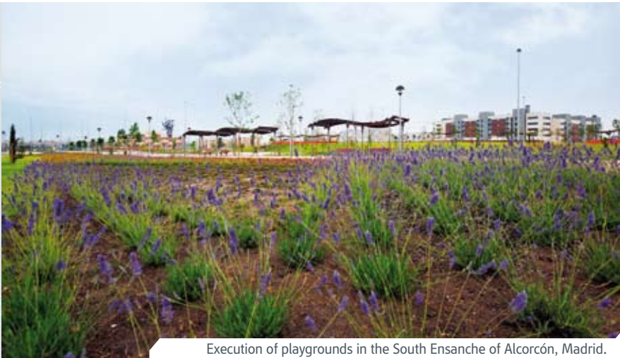
Execution of playgrounds in the South Ensanche of Alcorcón, Madrid.