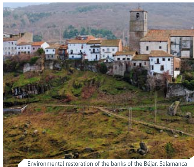
Environmental restoration of the banks of the Béjar, Salamanca