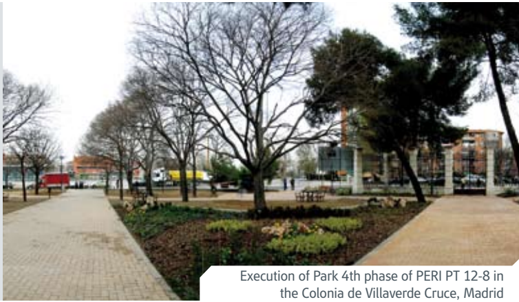
Execution of Park 4th phase of PERI PT 12-8 in the Colonia de Villaverde Cruce, Madrid