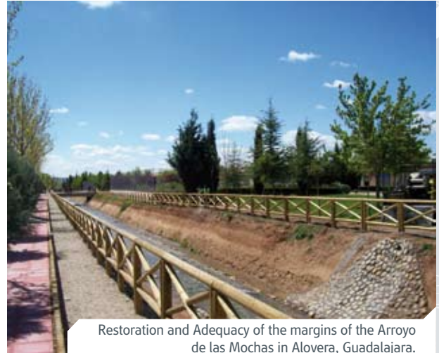
Restoration and Adequacy of the margins of the Arroyo de las Mochas in Alovera, Guadalajara.