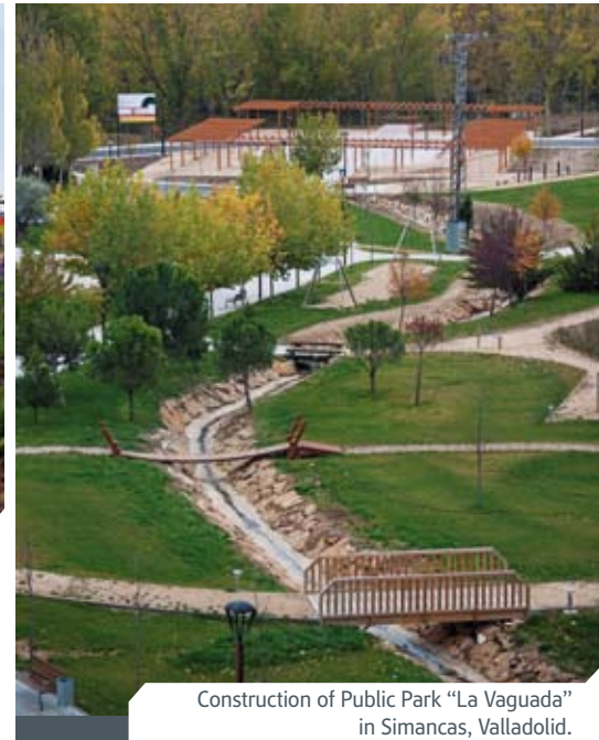
Construction of Public Park “La Vaguada” in Simancas, Valladolid.