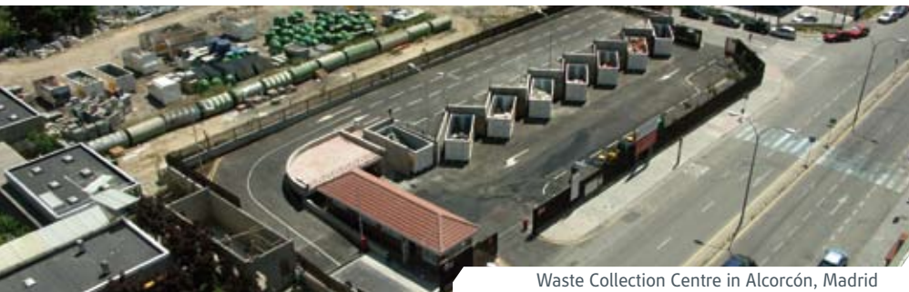
Waste Collection Centre in Alcorcón, Madrid

The number of projects implemented represents the commitment acquired years ago in terms of protection and conservation of the Environment.