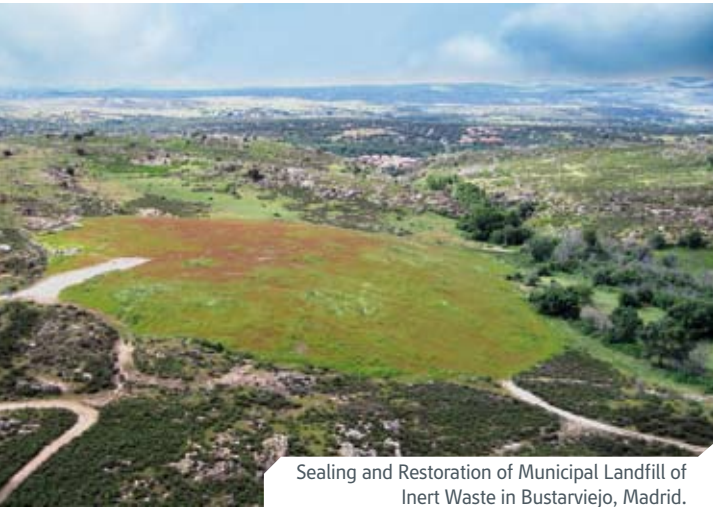
Sealing and Restoration of Municipal Landfill of Inert Waste in Bustarviejo, Madrid.