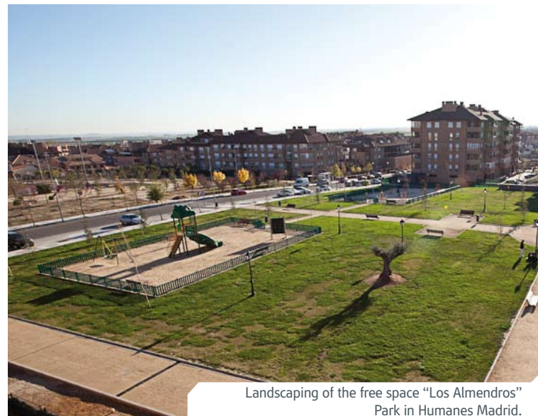
Landscaping of the free space “Los Almendros” Park in Humanes Madrid.