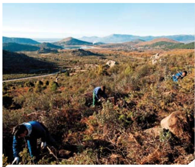
Reforestation in the Woodlands of Public Benefit no. 197 “Los Almorchones” and no. 24 “Pinar de la Barranca” in Navacerrada, Madrid.