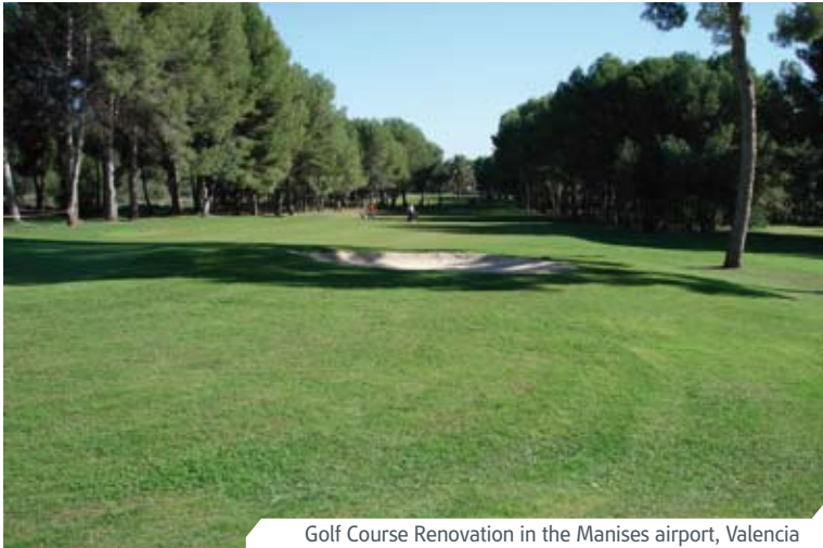
Golf Course Renovation in the Manises airport, Valencia