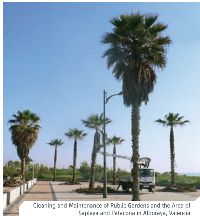
Cleaning and Maintenance of Public Gardens and the Area of Saplaya and Patacona in Alboraya, Valencia