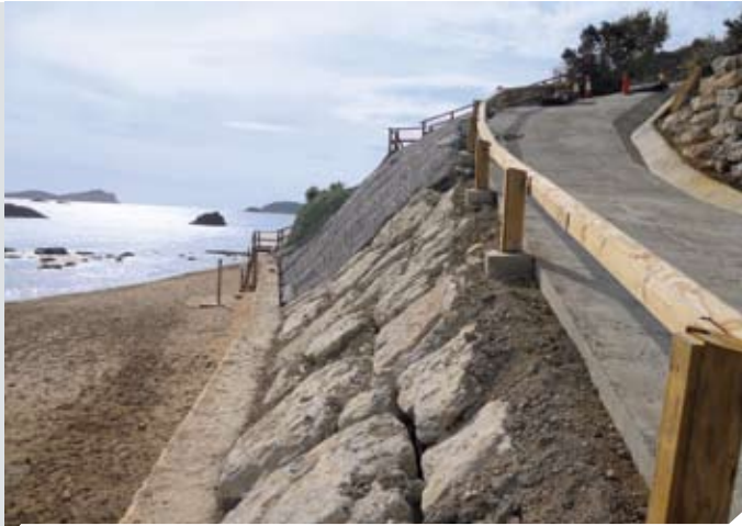
Embankment protection works in the Aguas Blancas beach in Ibiza, Balearic.