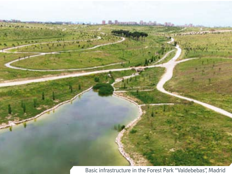
Basic infrastructure in the Forest Park “Valdebebas”, Madrid