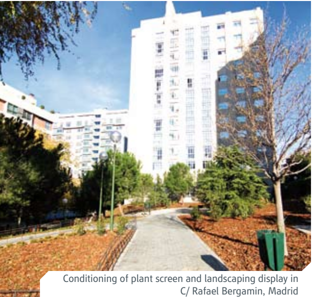
Conditioning of plant screen and landscaping display in C/ Rafael Bergamin, Madrid