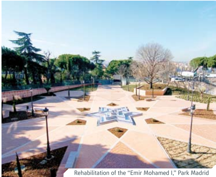
Rehabilitation of the "Emir Mohamed I," Park Madrid