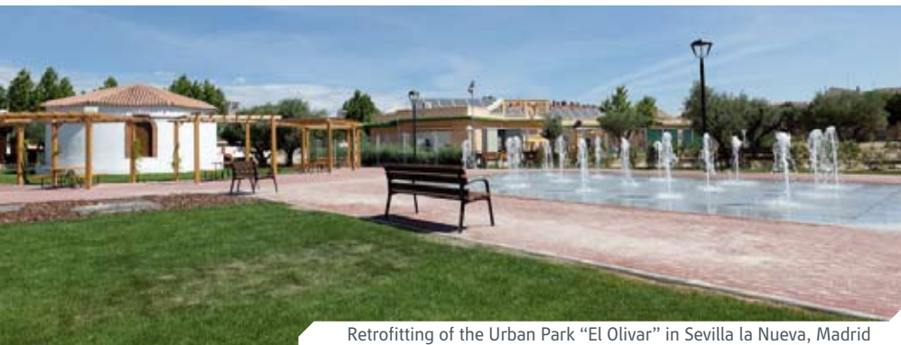
Retrofitting of the Urban Park "El Olivar" in Sevilla la Nueva, Madrid