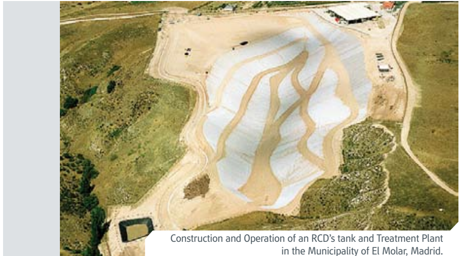
Construction and Operation of an RCD's tank and Treatment Plant in the Municipality of El Molar, Madrid.

At INDITEC we understand that positive management of waste decreases the consumption of natural resources by encouraging recycling and recovery of degraded areas