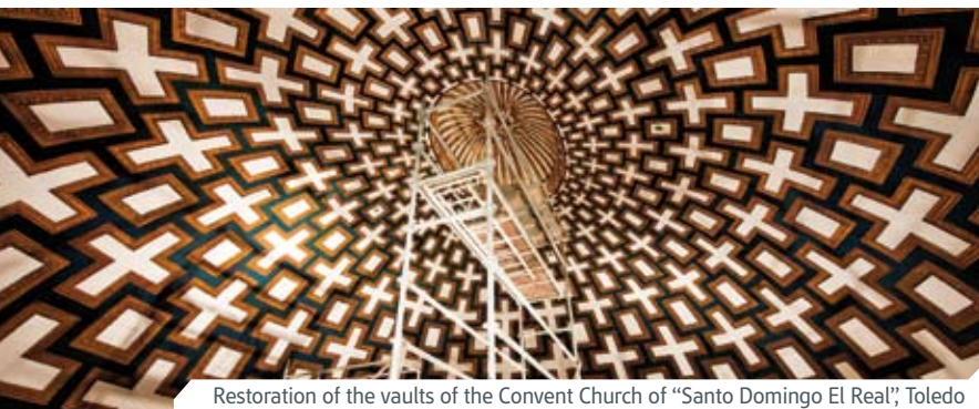
Restoration of the vaults of the Convent Church of "Santo Domingo El Real", Toledo