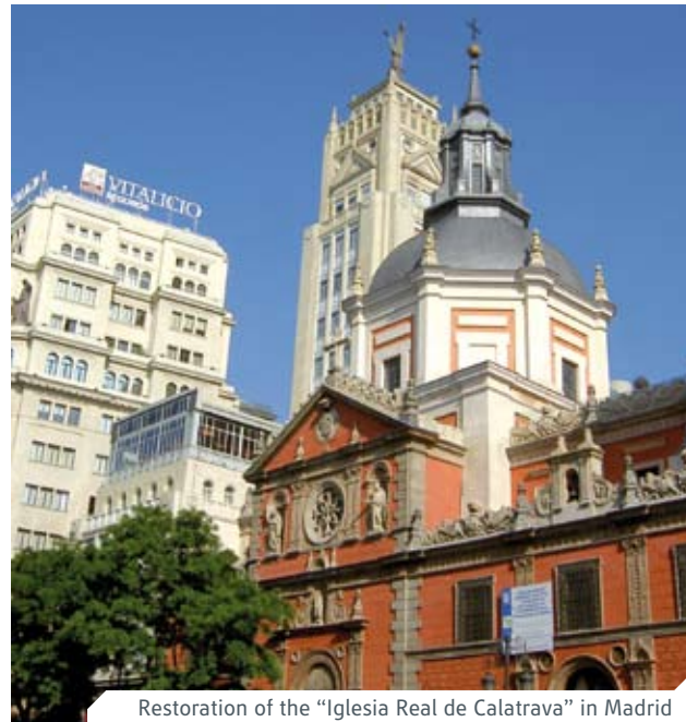
Restoration of the “Iglesia Real de Calatrava” in Madrid