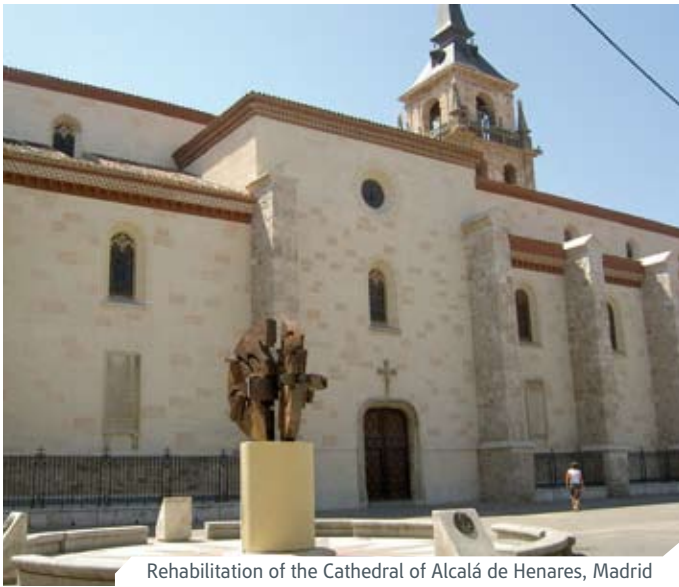
Rehabilitation of the Cathedral of Alcalá de Henares, Madrid