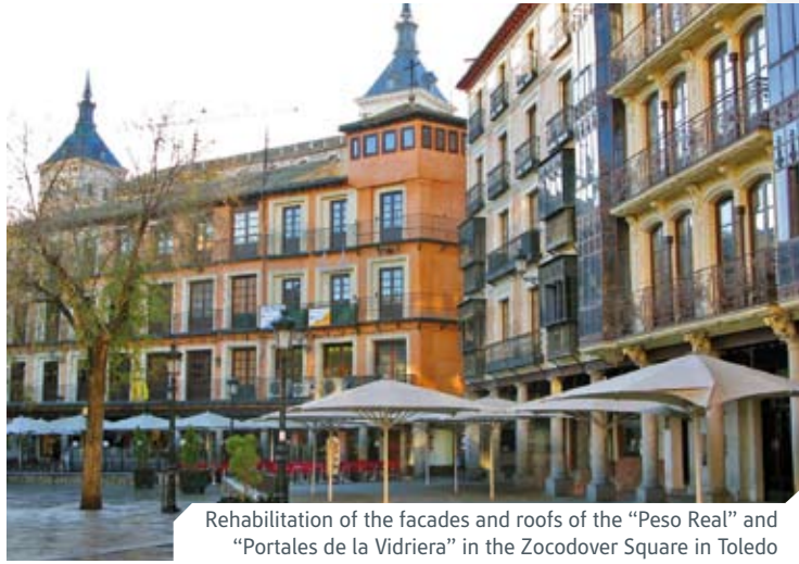
Rehabilitation of the facades and roofs of the "Peso Real" and "Portales de la Vidriera" in the Zocodover Square in Toledo