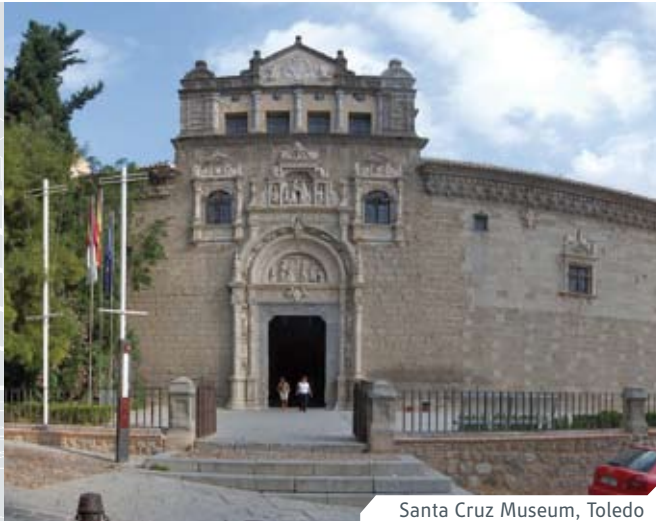
Santa Cruz Museum, Toledo