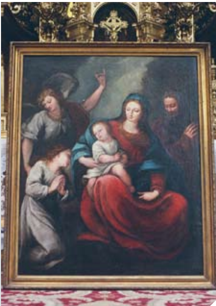
Restoration of paintings, Altarpieces and Pews in the Church of the Conception of Calatrava, Madrid

In the same spirit of service and quality applied to the Restoration and Rehabilitation works, CONDISA conducts Remodelling and Construction work for Unique Projects..