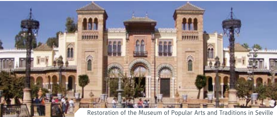
Restoration of the Museum of Popular Arts and Traditions in Seville

We specialize in the rehabilitation and restoration of monuments and buildings of historical, artistic and/or unique value: cathedrals, religious buildings, castles, bridges, public buildings and private property.