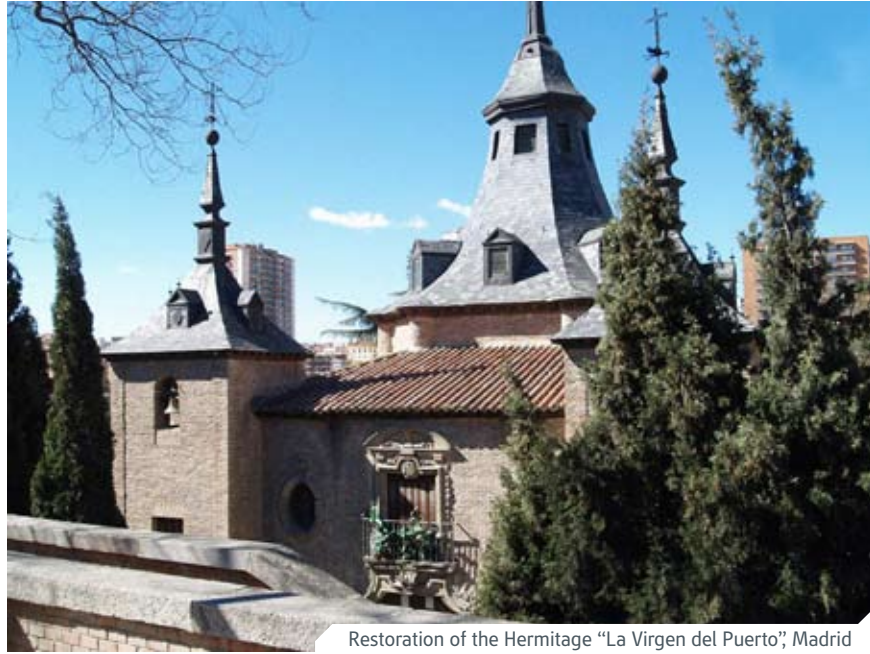
Restoration of the Hermitage "La Virgen del Puerto", Madrid

We specialize in the rehabilitation and restoration of monuments and buildings of historical, artistic and/or unique value: cathedrals, religious buildings, castles, bridges, public buildings and private property.