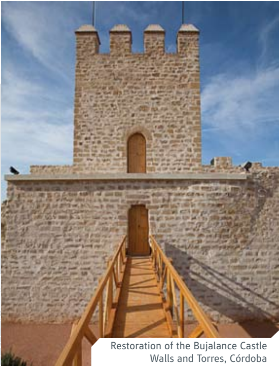
Restoration of the Bujalance Castle Walls and Torres, Córdoba