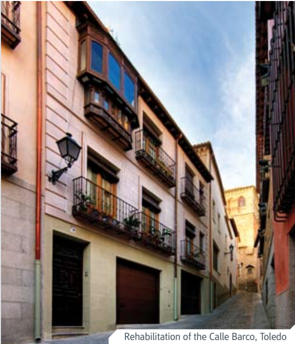
Rehabilitation of the Calle Barco, Toledo