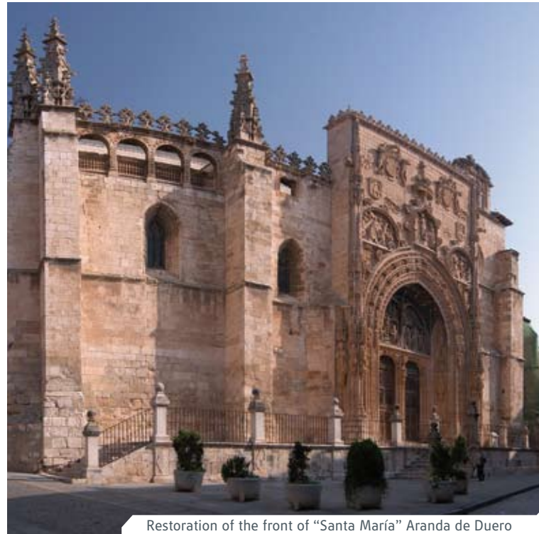
Restoration of the front of "Santa María" Aranda de Duero