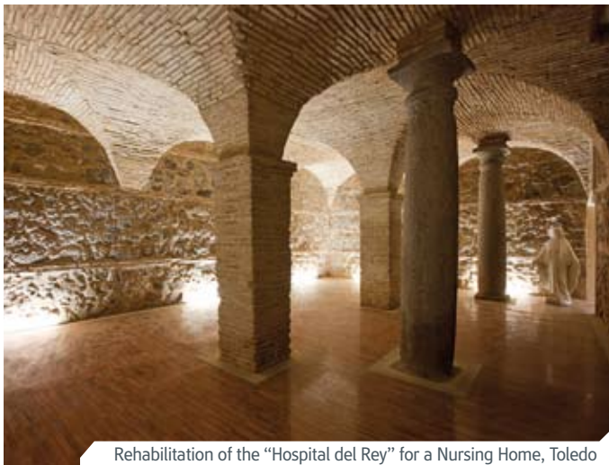
Rehabilitation of the “Hospital del Rey” for a Nursing Home, Toledo