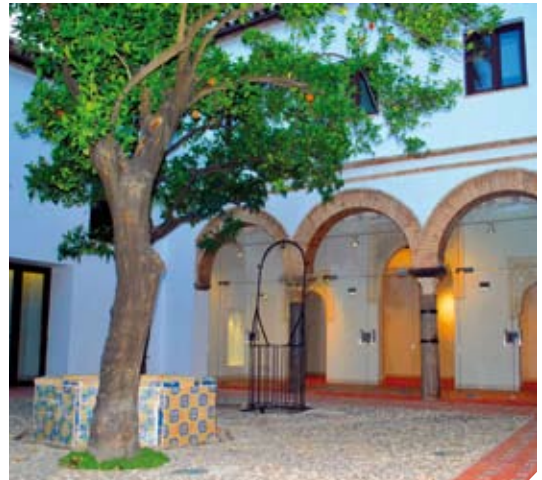
Rehabilitation of the "Mudejar House" in Córdoba